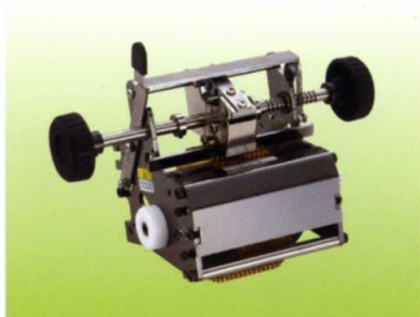
● Head unit G (character wheel system)

Different types of marking head unit options to accommodate various applications