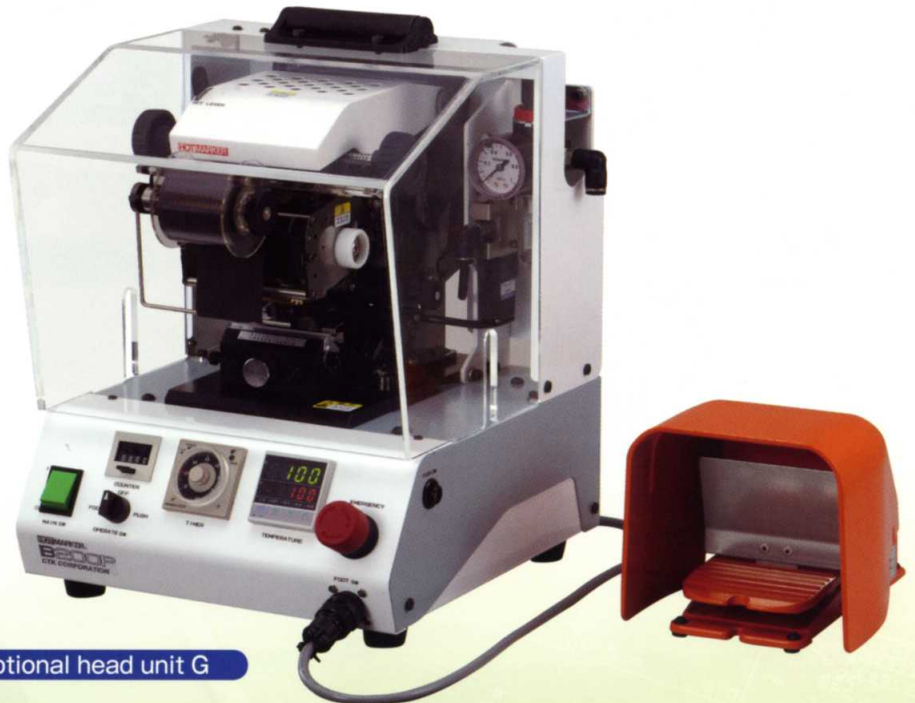
Photo: B200P with optional head unit G

Pneumatic controlled Legible markings are obtainable constantly Suitable for large volume markings