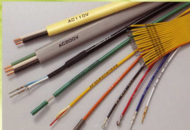
Electric wires Optic fibers