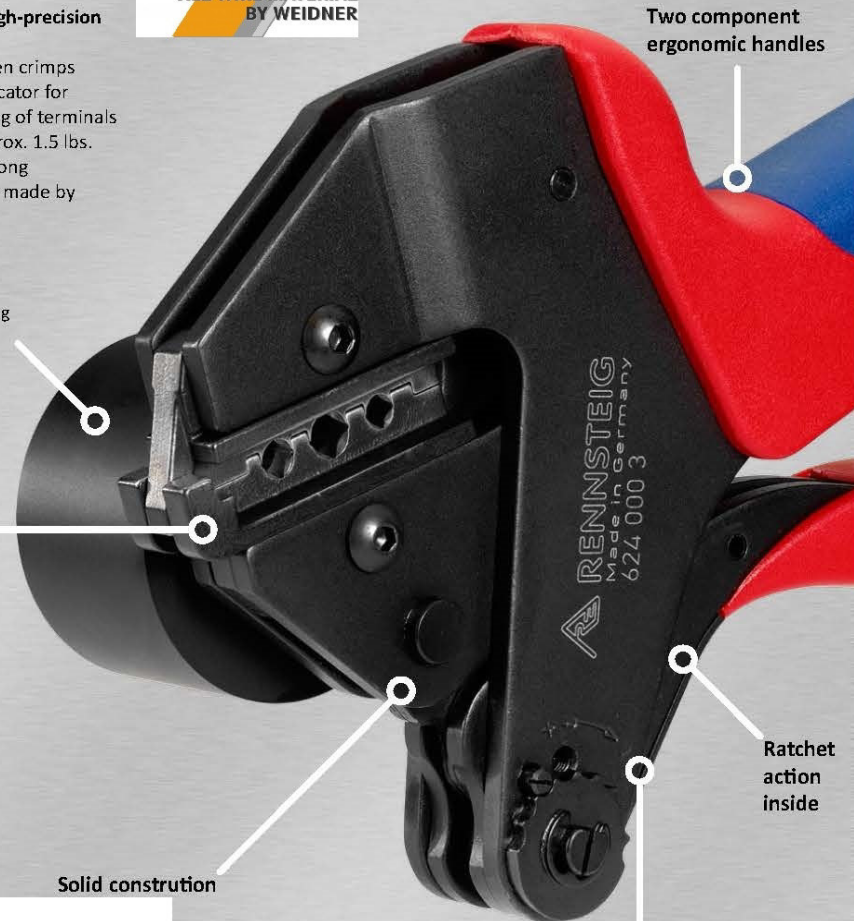
Two component ergonomic handles