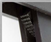
Double-plated ratchet gear extends tool life